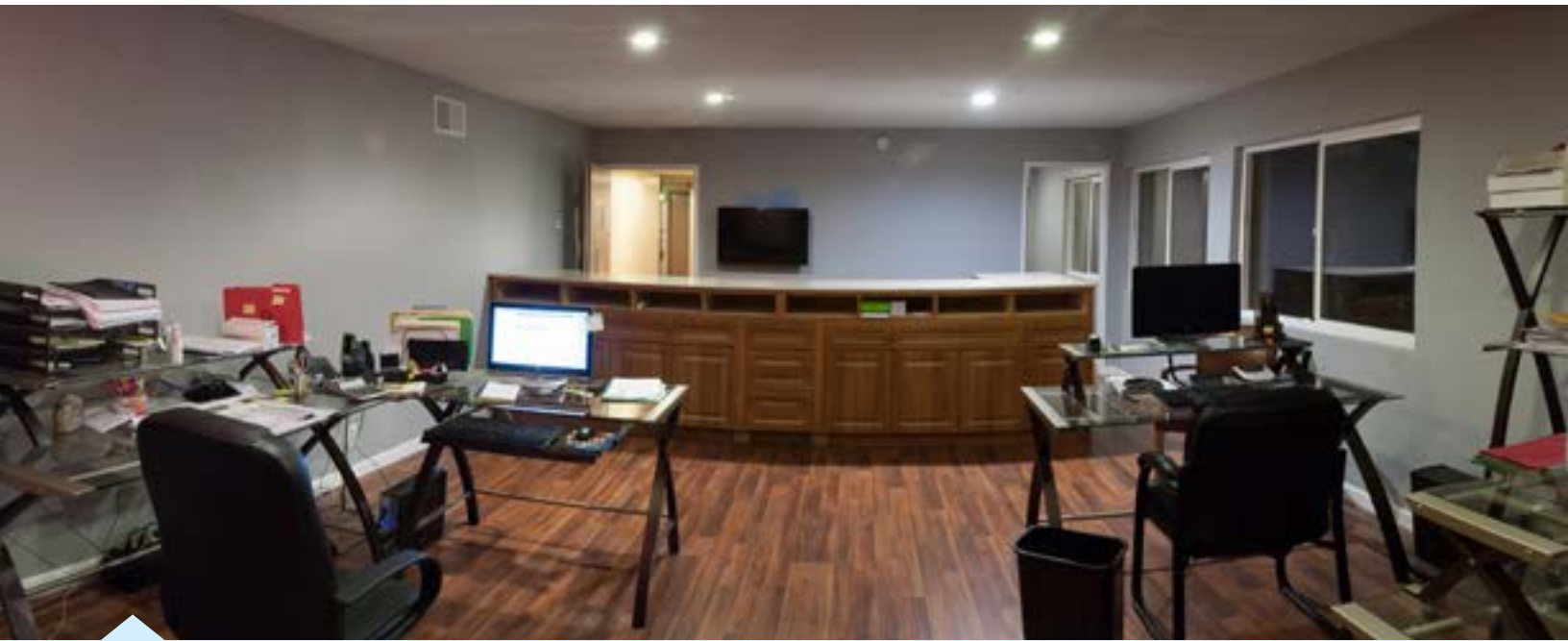
Clubhouse sales and administrative office now features an entry counter to serve residents. Conference room, not shown, adjoins office. Remaining first floor facilities, including the public lounge, sauna rooms and bathrooms, are expected to be finished by late April.

T he Summit's 4,000 square-foot Clubhouse is now being remodeled and redecorated as part of a plan to upgrade the park's amenities for the first time since the 59-acre enclave's inception in 1979.