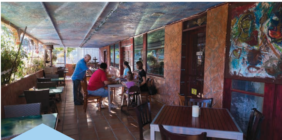
The front patio dining area features a zen fountain. The cafe will soon open a back patio area, which will increase total dining capacity to 130 guests.

to make everything compliant with Americans With Disabilities Act requirements. But the long wait, he says, has been worthwhile.