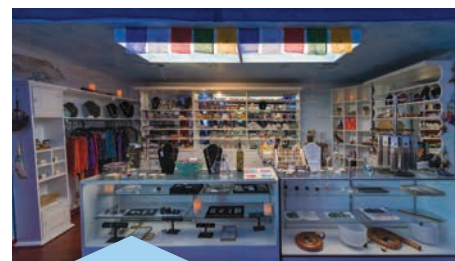
The metaphysical store inside Cafe Della Vita features a myriad of "healing" items, such as sage, incense, candles, crystals and a "singing bowl" to balance chakras. A selection of clothing and jewelry is also offered.